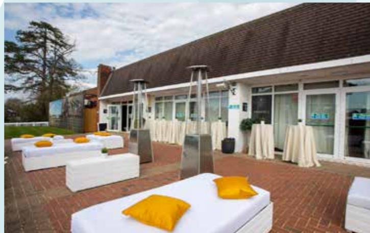
ADJOINING PATIO AREA