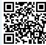
Scan to see our drone footage

Elevate any affair to soaring heights and come away feeling on top of the world.