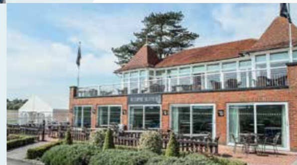
LOWER ECLIPSE TERRACE