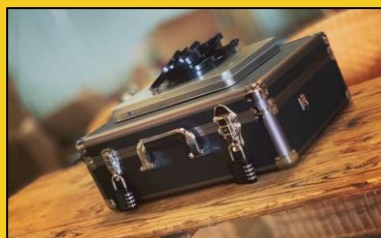
TABLE TOP ESCAPE GAME

Our tabletop escape game is the most portable escape game on the market. Taking all the fun and challenges of an escape game, we have condensed it down into a tabletop challenge. split into teams players must work together to crack into the safe, solving a series of puzzles and clues along the way. taking on the roles of professional bank thieves, working together for one last score. A local bank's security has grown pretty lax as of late and you know it's the perfect time to strike. you must work fast, as you are not the only team of criminals after this perfect prize. After overcoming the initial problem of escaping police custody, your team must complete the challenges in order to get the security code of the banks safe. The first team to do so will be taking home the gold!